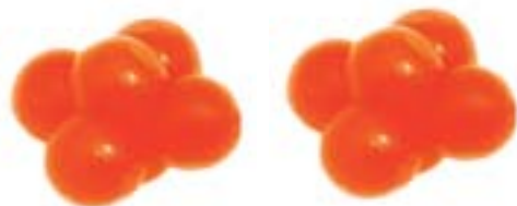
JENSEN EGG CLUSTERS™

Peach. Drift fishermen use yarn to give their lures added appeal and color. By tying a tuft on the hook itself, or just below the bobber so as not to interfere with its action, you will often increase a bobber's effectiveness. As indicated earlier, yarn also can catch in the teeth of fish, allowing you extra time to feel the "take" and set the hook.