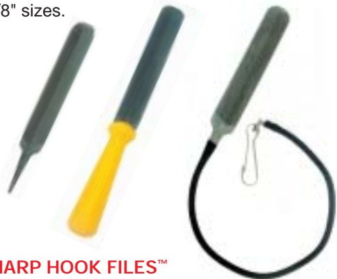
SHARP HOOK FILES™

SHARP HOOK FILE™: Another of the easiest, yet most important, things you can do to improve your fishing success, is to maintain sticky-sharp hooks on your lures at all times. A fine-toothed file such as Luhr Jensen's Sharp Hook File™ is the absolute best hook sharpening tool available. Hold it parallel to the hook point and with gentle, one-way strokes, remove a small amount of metal on at least two sides of the point. This will create a point with a knife-like cutting edge. Keep the file clean and dry and occasionally spray it with a noncorrosive lubricant such as WD-40™. Sharp Hook Files are available in 5 1/2" x 3/4" or 4 1/4" x 5/8" sizes.