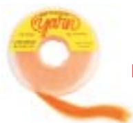
FAT 'n FUZZY YARN™

FAT 'n FUZZY YARN™: A fluffy and durable fishing yarn in a reusable dispenser. Colors include #0077 Fire, #0078 Cerise, #0080 Chartreuse, #0084 Black, #0085 White, #0093 Orange, #0193 Fluorescent Green, #0218 Red, #0625 Pink and #0867